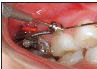
691 Pseudo-Class III

The mask on this month's cover is from Africa.