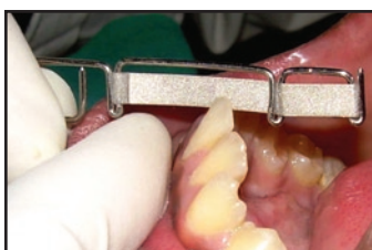
718 Strip Holder